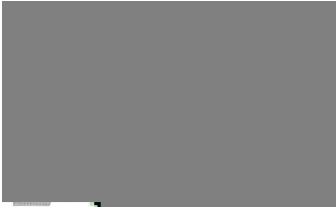
Figure 2: PAR model (Blaikie et al. 1994)

The model proposes a 'progression' of vulnerability with three main levels: root causes, dynamic pressures and unsafe conditions.